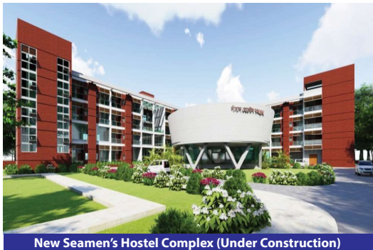
New Seamen's Hostel Complex (Under Construction)

Bangladesh is a traditional maritime country. It has a long tradition of producing the best professional seafarers. Bangladeshi Seafarer's are known for their efficiency, devotion to duty, courage to face the hazards of the sea & their simplicity. To ensure seafarer's welfare activities, Bangladesh has been closely associated with International Labor Organization (ILO) & ratified many ILO conventions and accepted various recommendations & has been incorporated into the National Law. Bangladesh has also ratified the Maritime Labor Convention-2006. The Government of the people's Republic of Bangladesh has established The Directorate of Seamen & Emigration Welfare under the administrative control of the Ministry of Shipping for the Welfare of seafarers. A part from the Shore based welfare facilities, as per provision of Regulation 4.4 of the MLC 2006, the Directorate are facilitating under mentioned welfare facilities: